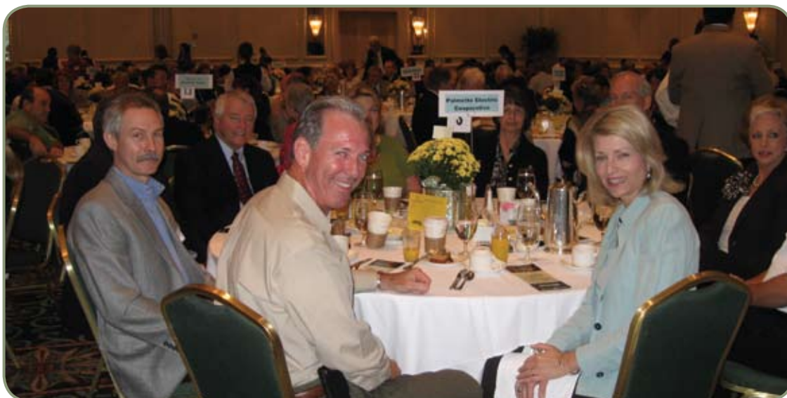
Over 600 people attended the 15th annual State of the Region Breakfast. Pictured is the Palmetto Electric Cooperative team.

HILTON HEAD ISLAND-BLUFFTON CHAMBER OF COMMERCE