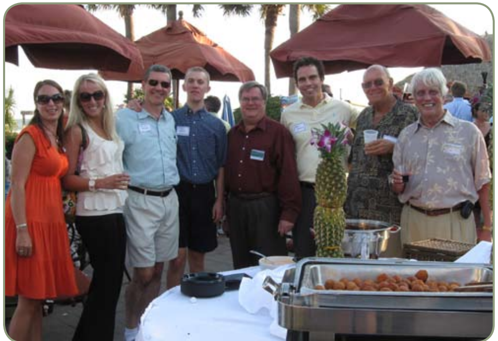
Chamber members enjoy networking at September's Business After Hours event at the Holiday Inn Oceanfront.