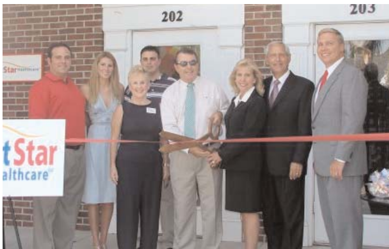
Ribbon cutting ceremony for BrightStar Healthcare, the Lowcountry's newest provider of healthcare staffing. BrightStar is located at 23 Plantation Park Drive in Bluffton.