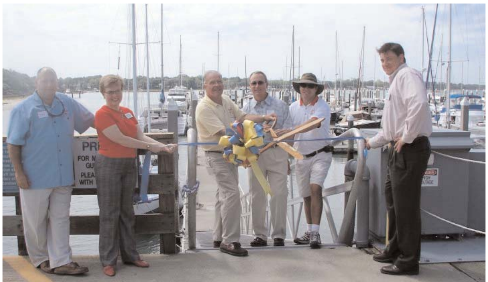
Ribbon cutting ceremony for Freedom Boat Club Hilton Head Island located in Skull Creek Marina.

A full-service commercial bank headquartered in Mt. Pleasant, S.C. Tidelands has expanded into the Hilton Head Island-Bluffton area with a loan production office and plans for more branches in the near future.