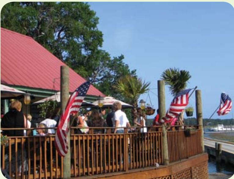
Networking at Up the Creek Pub includes waterfront breezes and a stellar view of the Broad Creek.